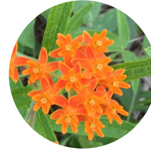
Butterfly Milkweed Asclepias tuberosa