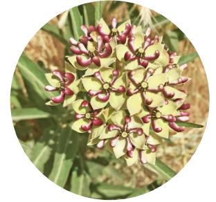
Antelope Horns Milkweed Asclepias asperula