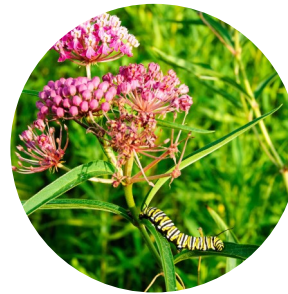
Swamp Milkweed Asclepias incarnata

Recognize any of these milkweeds? Chances are, one of them is growing in a nearby habitat. Visit plantmilkweed.org to learn more.