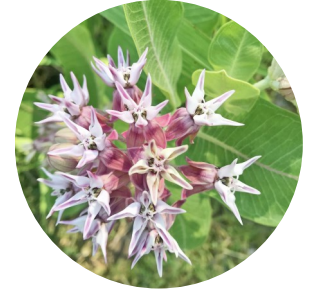
Showy Milkweed Asclepias speciosa