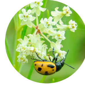
Whorled Milkweed Asclepias verticillata