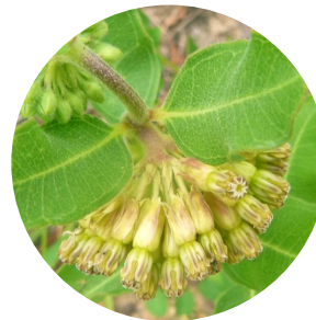
Green Milkweed Asclepias viridiflora